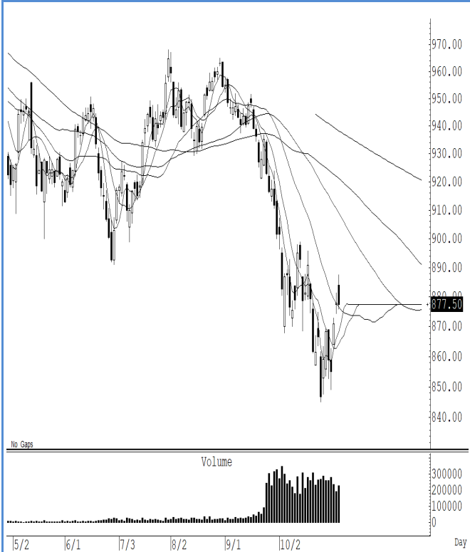
S50Z23 (Close 877.50 Chg -0.50)